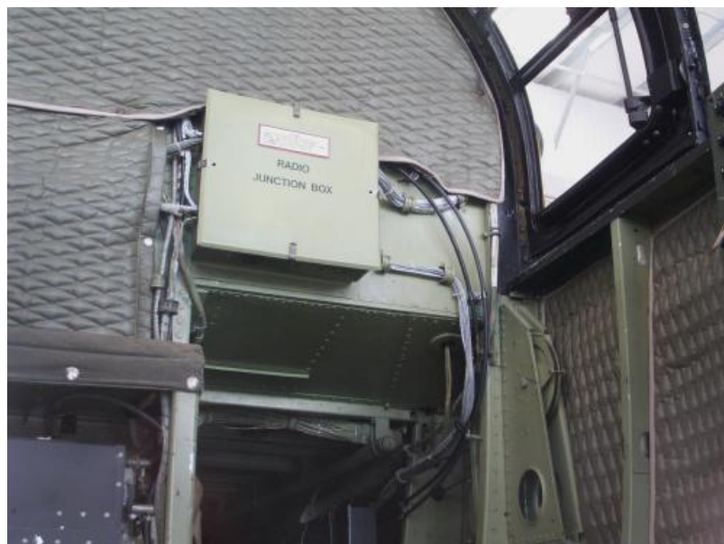
Radio Junction Box