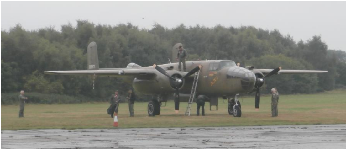
"Sarinah" Dunsfold 24 aug. 2013