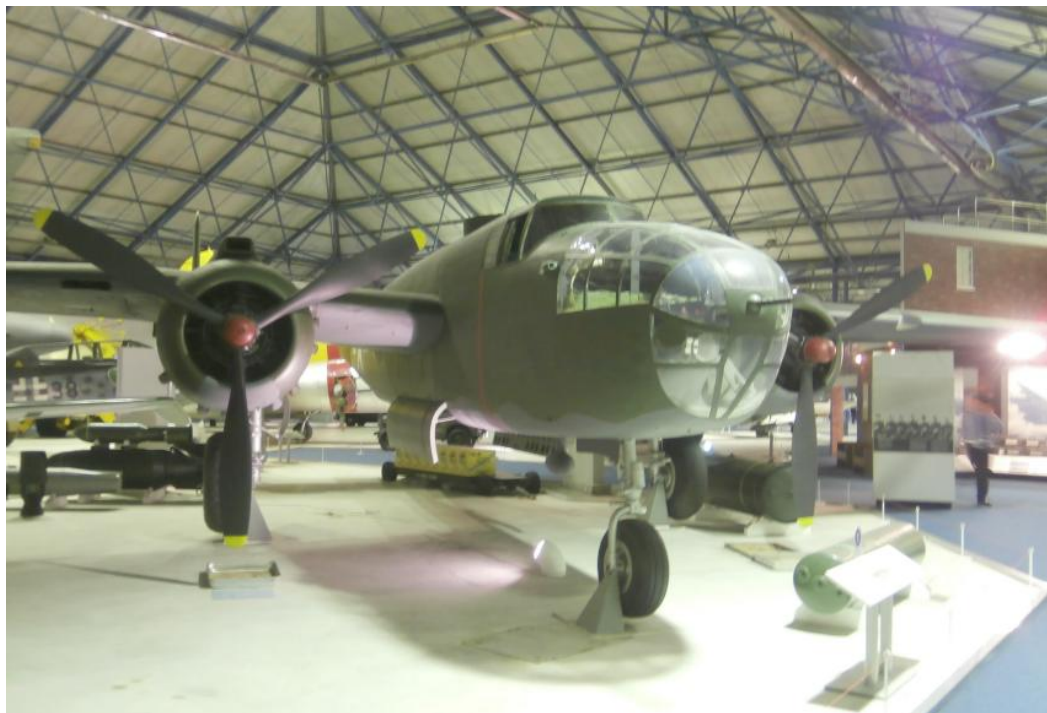
London, R.A.F. Museum