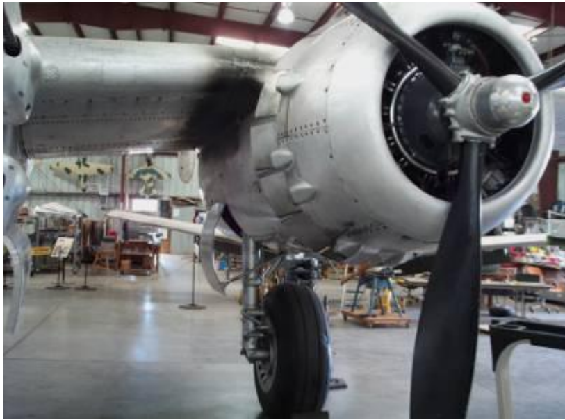
Museum Chino Airbase CA