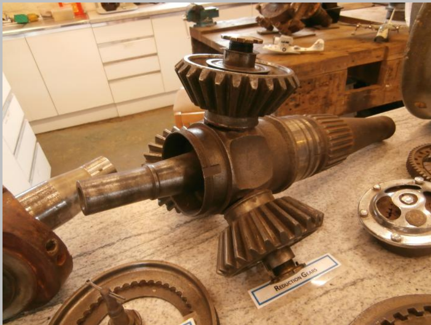
Recovered parts of a Sunderland MK I engine are being cleaned and on display